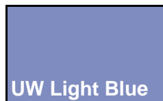
UW Light Blue Pantone 659